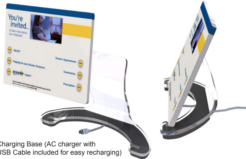
Charging Base (AC charger with USB Cable included for easy recharging)

Sleek Infinity Tablet educates and informs at the most critical point of contact